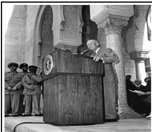
President Dwight Eisenhower dedicates the Islamic Center on June 28, 1957