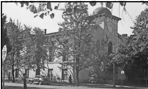
In 1949 the building was the Ohav Shalom Synagogue.